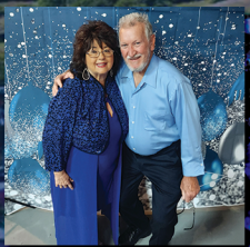
The Singing Byrds