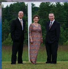
Joyful Sound Trio