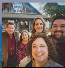
The King Family